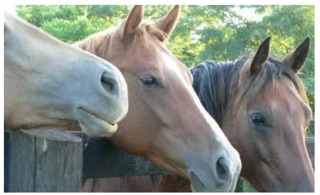
Just hanging out with my horse friends.