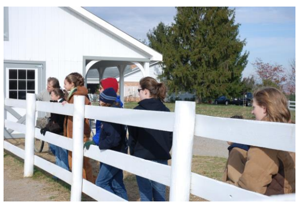
Horsemanship Clinic at Canterbury Farms, Christiansburg, Virginia