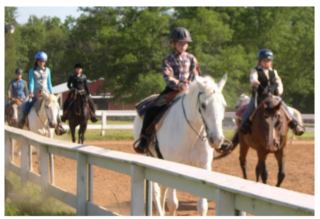
Rustburg Horse Show