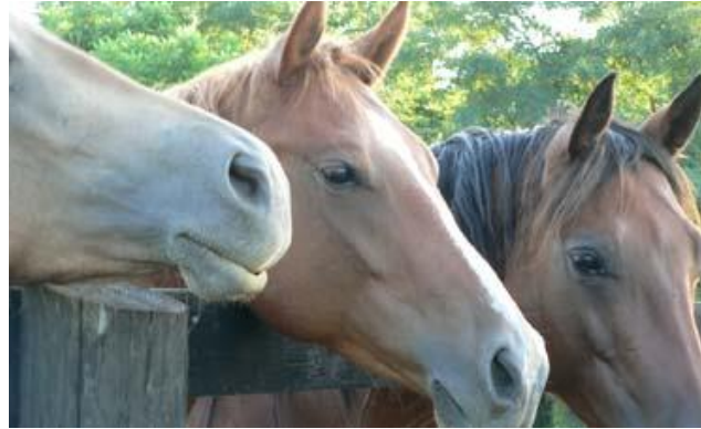
Just hanging out with my horse friends.