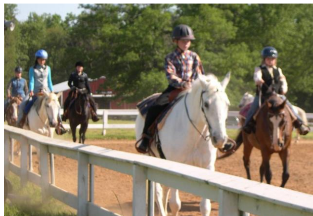
Rustburg Horse Show