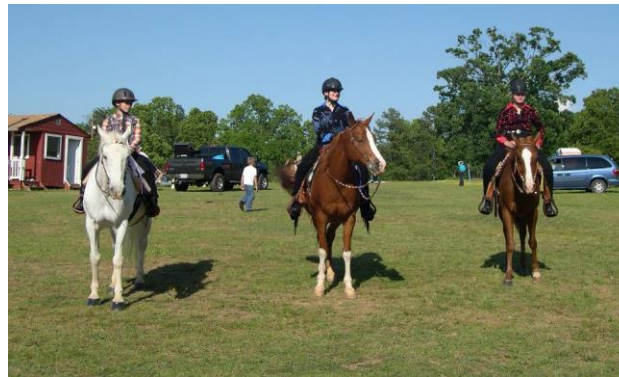
Mountain Trails 4-H'ers at Rustburg Show