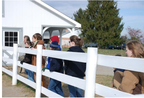
Horsemanship Clinic at Canterbury Farms, Christiansburg, Virginia